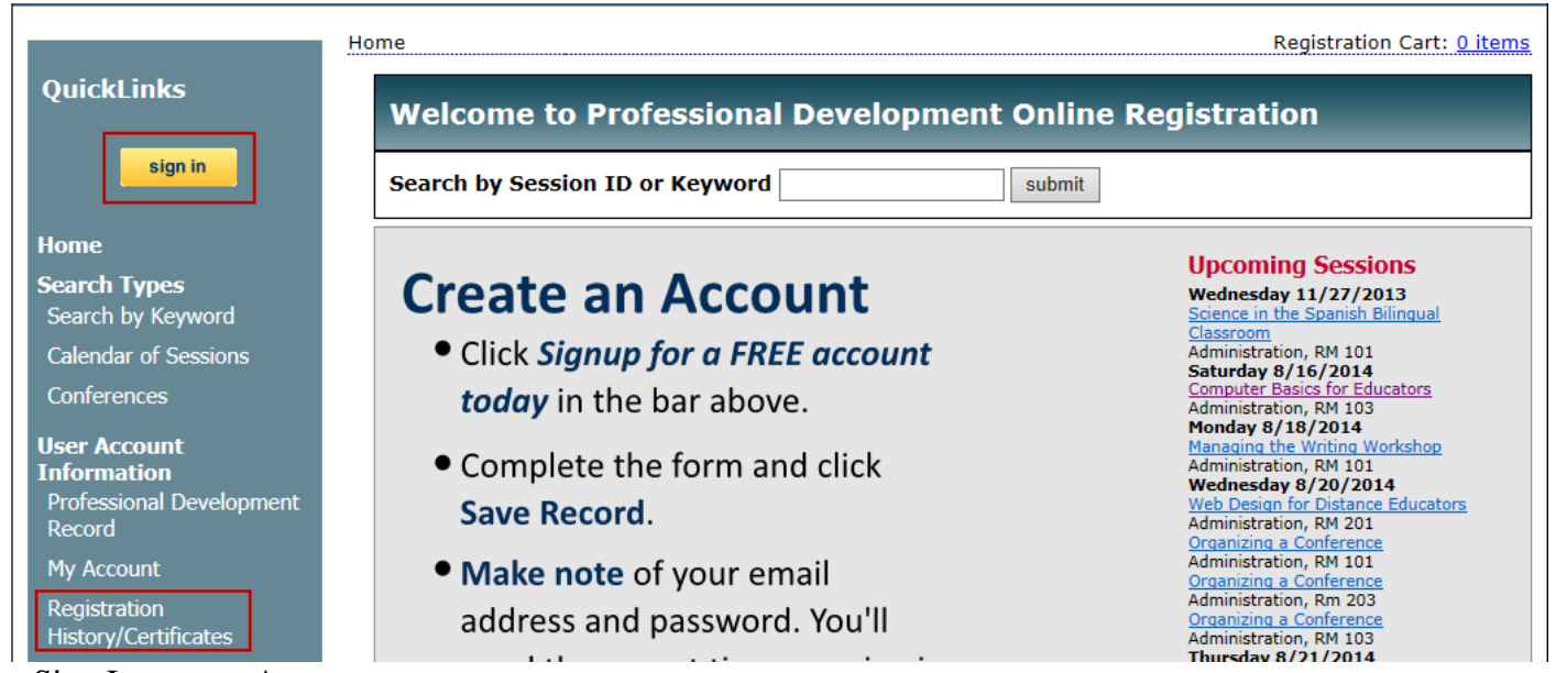
Sign In to your Account

Once you have been marked attended for an event, you will receive an email notification thanking you for attending and asking you to visit the Registration History page to complete the evaluation and print the Certificate of Completion for the event.